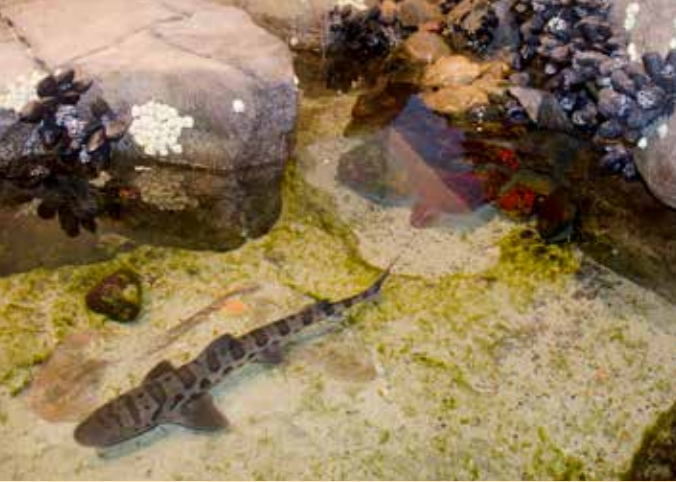
Experience many tide pool residents at the visitor center's exhibits.