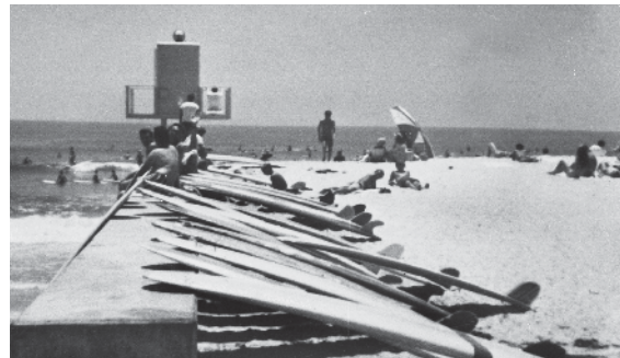
1967 surfers' mecca

In the late 1930s, the Civilian Conservation Corps (CCC) constructed campgrounds, picnic areas, and the custodian's lodges at Doheny beach and at nearby San Clemente. The sole CCC remnant at Doheny is a plaster and tile wall and entryway near the campground.